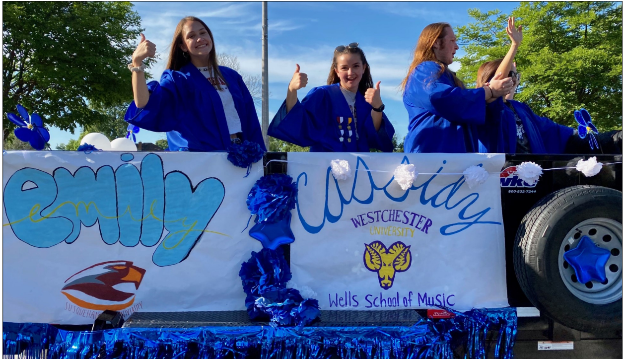
Community celebrates Class of 2020